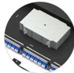
Multi-functional Sliding Patch Box, Modular