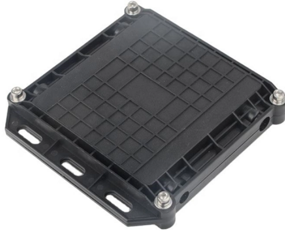
Photo of the three-level distribution box